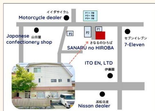
Parking for 11 cars available